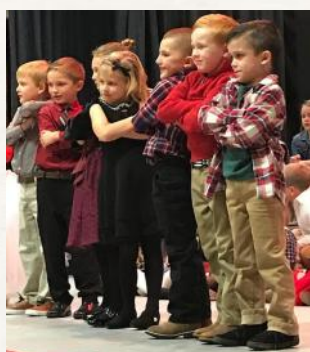
The 1st graders were a hit with their song "Nice Not Naughty" at the Christmas program.