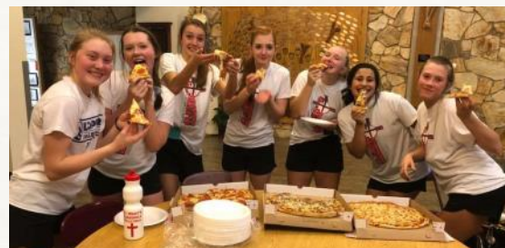
SMH Volleyball team enjoys a pizza break!

St. Mary's high school students have been paired up with grade school students to be "Cardinal Buddies." Here they are enjoying donuts together during Homecoming week.