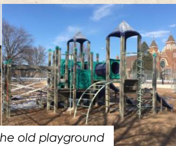
"Before" shots of the old playground