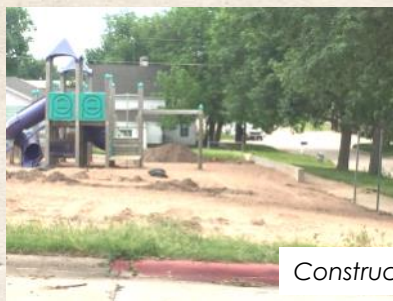
Construction is just beginning