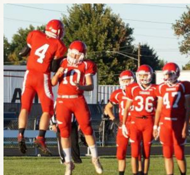
A moment of celebration on the football field!